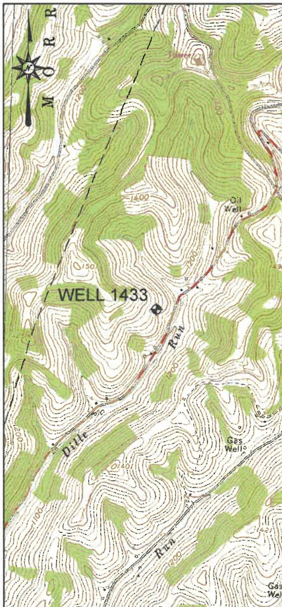
LOCATION MAP SCALE: 1" = 2000'

RECOVERED DATE ESTABLISHED: JUNE 18, 2025